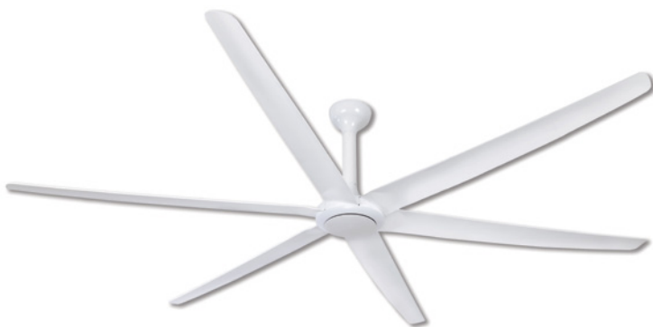
TBF0861 MATT WHITE