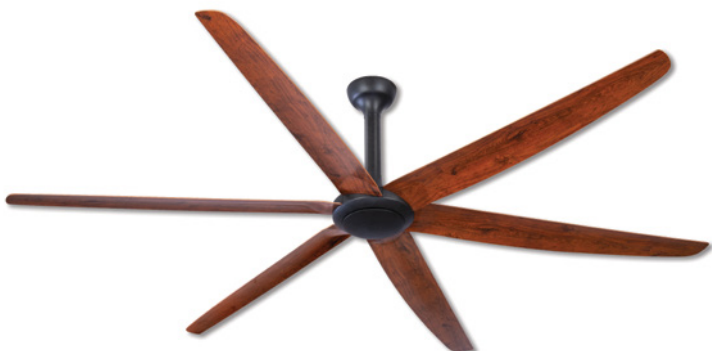
TBF0864 MATT BLACK WITH NATURAL OAK

With Natural Oak finished blades 218cm (86")