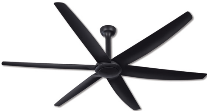
TBF0862 MATT BLACK